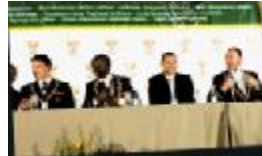
BOUND: President Thabo Mbeki and Jake White swap ties during the Springboks Rugby World Cup win celebration ticker tape parade in Pretoria and Johannesburg.

"Jake aggravated a lot of people in the council by attacking